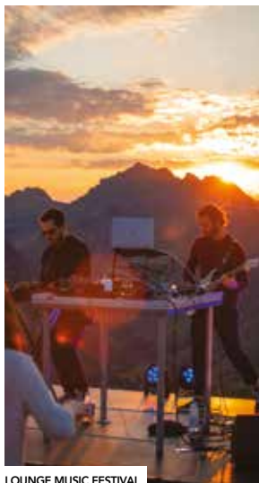
LOUNGE MUSIC FESTIVAL