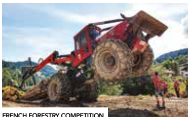
FRENCH FORESTRY COMPETITION