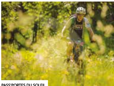
PASS'PORTES DU SOLEIL