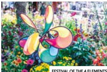
FESTIVAL OF THE 4 ELEMENTS