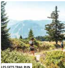
LES GETS TRAIL RUN