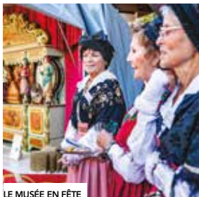
LE MUSÉE EN FÊTE