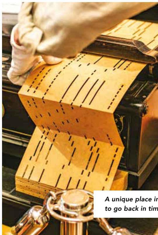
A unique place in Europe to go back in time.